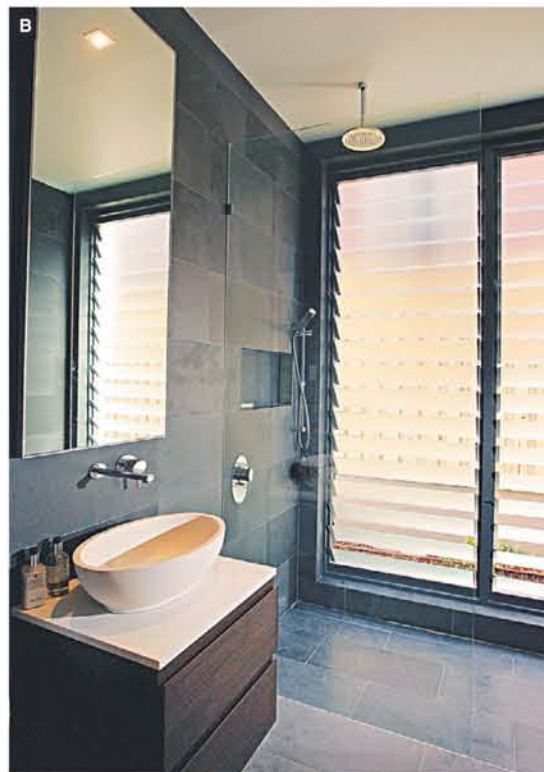
A The streamlined kitchen, dining and living area B The bathroom features louvre windows, modern fittings and fixtures, and a frameless shower screen C One of the four bedrooms D The upstairs has two bedrooms and an open living area